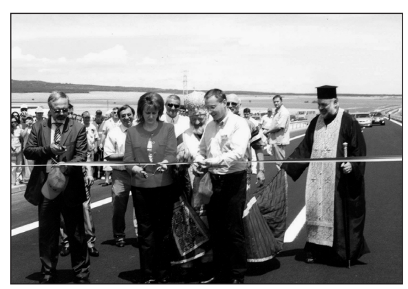
Prime Minister Sergei Stanishev inaugurated a section of Trakia motorway

The Prime Minister was welcomed by Minister of Regional Development and Public Works Assen Gagauzov, Stara Zagora District Governor Maria Neykova, and Mayor Evgeni Zhelev. The event is not only of regional importance, but of national one, said Sergei Stanishev in his opening speech. Without the necessary infrastructure we can hardly talk about attracting